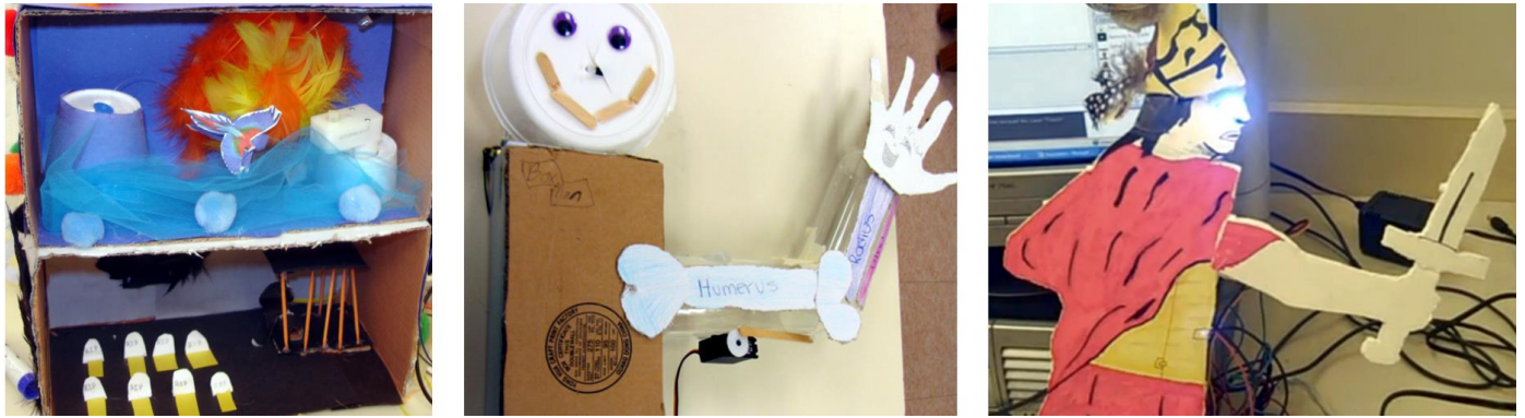
Fig. 1. Student built robots, from left to right, robot theater (I Know Why the Caged Bird Sings by Maya Angelou), arm model, and historical figure (Alexander the Great).

connected technological fluency to arts education, which is well-regarded and supported in school systems and by students who may not have strong prior experience with electronics. We focused efforts on integration with non-technical, core courses in order to engage students in engineering and programming practice who would otherwise avoid enrolling in a technical elective course or extracurricular activity.